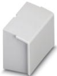
Keying tab 53.6 mm

Please be informed that the data shown in this PDF Document is generated from our Online Catalog. Please find the complete data in the user's documentation. Our General Terms of Use for Downloads are valid ( http://download.phoenixcontact.com )