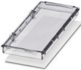
Transparent cover for installation housing BC 107.6...

Please be informed that the data shown in this PDF Document is generated from our Online Catalog. Please find the complete data in the user's documentation. Our General Terms of Use for Downloads are valid ( http://download.phoenixcontact.com )