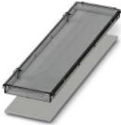
Transparent cover for installation housing BC 161,6...

Please be informed that the data shown in this PDF Document is generated from our Online Catalog. Please find the complete data in the user's documentation. Our General Terms of Use for Downloads are valid ( http://download.phoenixcontact.com )