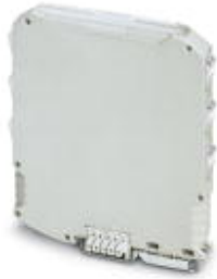
Electronic housing, design width 12.5 mm, 3 connection levels per side, for DIN rail bus connectors

Please be informed that the data shown in this PDF Document is generated from our Online Catalog. Please find the complete data in the user's documentation. Our General Terms of Use for Downloads are valid ( http://download.phoenixcontact.com )