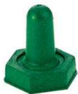
Protection cap 343.001.013 - green 343.001.023 - black 343.001.033 - red