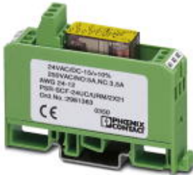
Universal safety relay with forcibly guided contacts, two PDT contacts, for U_N 24 V AC/DC

Please be informed that the data shown in this PDF Document is generated from our Online Catalog. Please find the complete data in the user's documentation. Our General Terms of Use for Downloads are valid ( http://download.phoenixcontact.com )