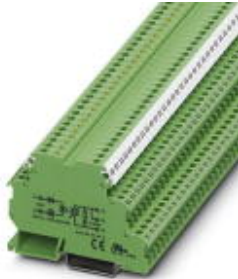
Power solid-state relay terminal block, input: 5 V DC, output: 10 - 253 V AC/800 mA, terminal block width: 6.2 mm

Please be informed that the data shown in this PDF Document is generated from our Online Catalog. Please find the complete data in the user's documentation. Our General Terms of Use for Downloads are valid ( http://download.phoenixcontact.com )