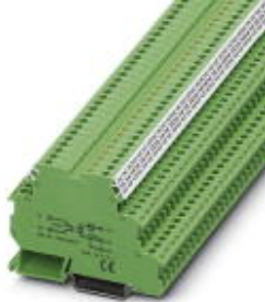
Power solid-state relay terminal block for actuator, input: 24 V DC, output: 3 - 30 V DC/3 A, terminal block width: 6.2 mm

Please be informed that the data shown in this PDF Document is generated from our Online Catalog. Please find the complete data in the user's documentation. Our General Terms of Use for Downloads are valid ( http://download.phoenixcontact.com )