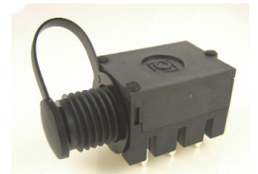
Black socket showing hole plug.