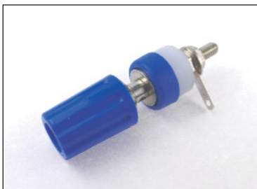
CL1507 - TP/1 BLUE ASSEMBLED