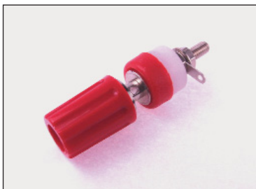
CL1506 - TP/1 RED ASSEMBLED