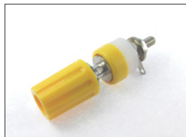
CL1512 - TP/1 YELLOW ASSEMBLED