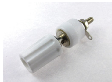
CL1509 - TP/1 WHITE ASSEMBLED