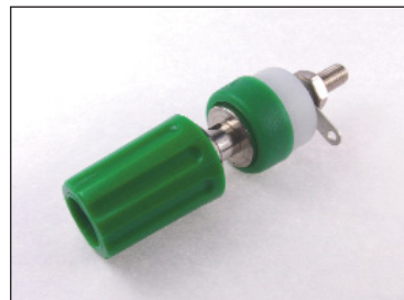
CL1508 - TP/1 GREEN ASSEMBLED