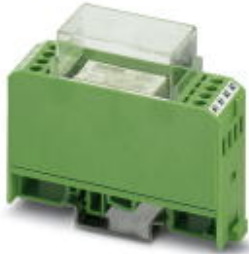
Relay module, with soldered-in miniature switching relay, contact (AgNi): Medium to large loads, 1 PDT, input voltage 24 V AC/DC

Please be informed that the data shown in this PDF Document is generated from our Online Catalog. Please find the complete data in the user's documentation. Our General Terms of Use for Downloads are valid ( http://download.phoenixcontact.com )