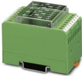
Lamp test module, 2 diodes with common cathode: with 4 pairs, for individual wiring

Please be informed that the data shown in this PDF Document is generated from our Online Catalog. Please find the complete data in the user's documentation. Our General Terms of Use for Downloads are valid ( http://download.phoenixcontact.com )