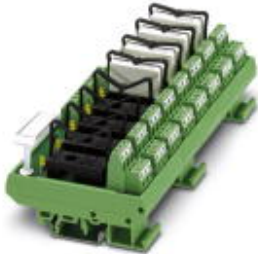
VARIOFACE module, with plug-in bases for 8 miniature relays with two PDT contacts, with light indicator

Please be informed that the data shown in this PDF Document is generated from our Online Catalog. Please find the complete data in the user's documentation. Our General Terms of Use for Downloads are valid ( http://download.phoenixcontact.com )