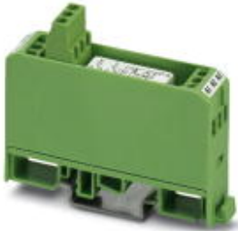
Relay module, with soldered-in miniature switching relay, contact (AgNi+Au): Small to large loads, 2 PDT, 230 V AC input voltage

Please be informed that the data shown in this PDF Document is generated from our Online Catalog. Please find the complete data in the user's documentation. Our General Terms of Use for Downloads are valid ( http://download.phoenixcontact.com )