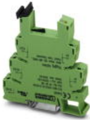
14 mm PLC basic terminal blocks with screw connection, 12 V DC input voltage (without relay or optocoupler)

Please be informed that the data shown in this PDF Document is generated from our Online Catalog. Please find the complete data in the user's documentation. Our General Terms of Use for Downloads are valid ( http://download.phoenixcontact.com )