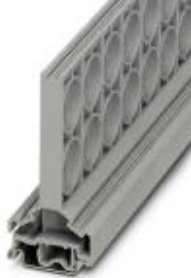
Empty housing, for mounting on NS 32 or NS 35/7.5, double-level

Please be informed that the data shown in this PDF Document is generated from our Online Catalog. Please find the complete data in the user's documentation. Our General Terms of Use for Downloads are valid ( http://download.phoenixcontact.com )