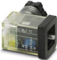
Valve connector, 3-pos., construction C, 1 LED, with protective circuit, screw connection, M12 cable gland

Please be informed that the data shown in this PDF Document is generated from our Online Catalog. Please find the complete data in the user's documentation. Our General Terms of Use for Downloads are valid ( http://download.phoenixcontact.com )