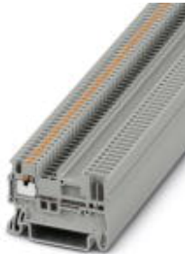
Feed-through terminal block, Connection method: Push-in / plug connection, Cross section: 0.14 mm 2 - 1.5 mm 2 , AWG: 26 - 16, Width: 3.5 mm, Color: gray, Mounting type: NS 35/7,5, NS 35/15

Please be informed that the data shown in this PDF Document is generated from our Online Catalog. Please find the complete data in the user's documentation. Our General Terms of Use for Downloads are valid ( http://download.phoenixcontact.com )