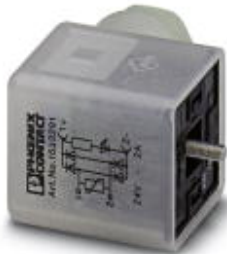
Valve connector, 3-pos., type A, 1 LED, with protective circuit and rectifier, screw connection, cable screw connection Pg9

Please be informed that the data shown in this PDF Document is generated from our Online Catalog. Please find the complete data in the user's documentation. Our General Terms of Use for Downloads are valid ( http://download.phoenixcontact.com )