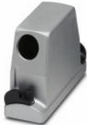
HEAVYCON ADVANCE EMV sleeve housing B24, with bayonet locking, height 100 mm, with 1xM32 thread, lateral cable outlet

Please be informed that the data shown in this PDF Document is generated from our Online Catalog. Please find the complete data in the user's documentation. Our General Terms of Use for Downloads are valid ( http://download.phoenixcontact.com )