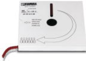
Ferrule, Length: 14 mm, Color: white

Please be informed that the data shown in this PDF Document is generated from our Online Catalog. Please find the complete data in the user's documentation. Our General Terms of Use for Downloads are valid ( http://download.phoenixcontact.com )