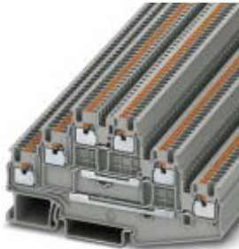
Multi-level terminal block, Cross section: 0.14 mm 2 - 1.5 mm 2 , AWG: 26 - 16, Connection type: Push-in connection, Width: 3.5 mm, Color: gray, Mounting type: NS 35/7,5, NS 35/15

Please be informed that the data shown in this PDF Document is generated from our Online Catalog. Please find the complete data in the user's documentation. Our General Terms of Use for Downloads are valid ( http://download.phoenixcontact.com )