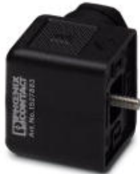
Valve connector, 4-pos., type A, unconnected, screw connection, cable screw connection Pg9

Please be informed that the data shown in this PDF Document is generated from our Online Catalog. Please find the complete data in the user's documentation. Our General Terms of Use for Downloads are valid ( http://download.phoenixcontact.com )