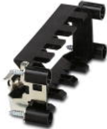
Sleeve frame, with PE connection to housing, for contact insert modules, type 4, number of insert modules: 5

Please be informed that the data shown in this PDF Document is generated from our Online Catalog. Please find the complete data in the user's documentation. Our General Terms of Use for Downloads are valid ( http://download.phoenixcontact.com )