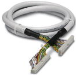
Round cable set, with two 14-pos. socket strips (1:1 connection), for connecting 8 channels, cable length: 2 m

Please be informed that the data shown in this PDF Document is generated from our Online Catalog. Please find the complete data in the user's documentation. Our General Terms of Use for Downloads are valid ( http://download.phoenixcontact.com )