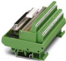
VARIOFACE module, with screw connection and D-Subminiature socket strip, for mounting on NS 35/7.5 or NS 32, with light indicator, 37-pos.

Please be informed that the data shown in this PDF Document is generated from our Online Catalog. Please find the complete data in the user's documentation. Our General Terms of Use for Downloads are valid ( http://download.phoenixcontact.com )