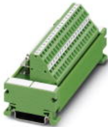
VARIOFACE module, with spring-cage connection and D-Subminiature socket strip, for mounting on NS 35/7.5, 37-pos.

Please be informed that the data shown in this PDF Document is generated from our Online Catalog. Please find the complete data in the user's documentation. Our General Terms of Use for Downloads are valid ( http://download.phoenixcontact.com )