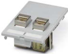
Front plate with contact inserts, plastic with shroud, 2x RJ socket/socket

Please be informed that the data shown in this PDF Document is generated from our Online Catalog. Please find the complete data in the user's documentation. Our General Terms of Use for Downloads are valid ( http://download.phoenixcontact.com )