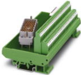
VARIOFACE module, for ELCO connector, for mounting on NS 35/7.5 or NS 32, with pin strip 8016 left, no. of positions 56

Please be informed that the data shown in this PDF Document is generated from our Online Catalog. Please find the complete data in the user's documentation. Our General Terms of Use for Downloads are valid ( http://download.phoenixcontact.com )