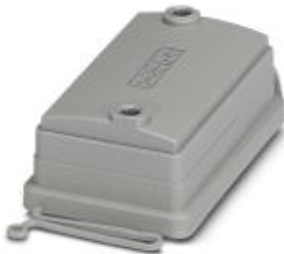
HEAVYCON ADVANCE IP50 protective cover B6, for panel mounting side, with clip locking, with retaining cord, diameter of retaining cord eyelet 3 mm

Please be informed that the data shown in this PDF Document is generated from our Online Catalog. Please find the complete data in the user's documentation. Our General Terms of Use for Downloads are valid ( http://download.phoenixcontact.com )