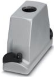
HEAVYCON ADVANCE EMV sleeve housing B16, with bayonet locking, height 100 mm, with 1x M40 thread, straight cable outlet

Please be informed that the data shown in this PDF Document is generated from our Online Catalog. Please find the complete data in the user's documentation. Our General Terms of Use for Downloads are valid ( http://download.phoenixcontact.com )