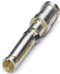
Turned 1.6 crimp contact, individual female contact, core diameter 2.5 mm 2 , silver-plated

Please be informed that the data shown in this PDF Document is generated from our Online Catalog. Please find the complete data in the user's documentation. Our General Terms of Use for Downloads are valid ( http://download.phoenixcontact.com )