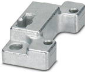
Panel mounting flange for HEAVYCON ADVANCE TMB housing with bayonet locking

Please be informed that the data shown in this PDF Document is generated from our Online Catalog. Please find the complete data in the user's documentation. Our General Terms of Use for Downloads are valid ( http://download.phoenixcontact.com )