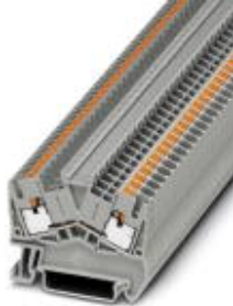
Feed-through terminal block, Connection method: Push-in connection, Cross section: 0.14 mm 2 - 4 mm 2 , AWG: 26 - 12, Width: 5.2 mm, Color: gray, Mounting type: NS 35/7,5, NS 35/15

Please be informed that the data shown in this PDF Document is generated from our Online Catalog. Please find the complete data in the user's documentation. Our General Terms of Use for Downloads are valid ( http://download.phoenixcontact.com )