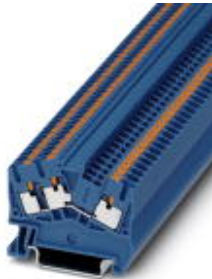
Feed-through terminal block, Connection method: Push-in connection, Cross section: 0.14 mm 2 - 4 mm 2 , AWG: 26 - 12, Width: 5.2 mm, Color: blue, Mounting type: NS 35/7,5, NS 35/15

Please be informed that the data shown in this PDF Document is generated from our Online Catalog. Please find the complete data in the user's documentation. Our General Terms of Use for Downloads are valid ( http://download.phoenixcontact.com )