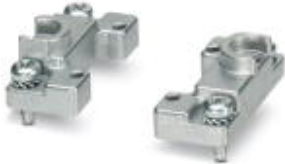
Panel mounting flange for screw locking, set comprising 2 panel mounting flanges with 4 self-tapping Torx® head screws and 4 fan-type washers

Please be informed that the data shown in this PDF Document is generated from our Online Catalog. Please find the complete data in the user's documentation. Our General Terms of Use for Downloads are valid ( http://download.phoenixcontact.com )