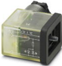
Valve connector, 3-pos., construction B, 1 LED, with protective circuit, screw connection, M16 cable gland

Please be informed that the data shown in this PDF Document is generated from our Online Catalog. Please find the complete data in the user's documentation. Our General Terms of Use for Downloads are valid ( http://download.phoenixcontact.com )