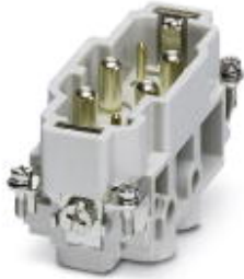
HEAVYCON male insert, K4/2 series, for 4 power and 2 control contacts, screw connection, product with Harting logo

Please be informed that the data shown in this PDF Document is generated from our Online Catalog. Please find the complete data in the user's documentation. Our General Terms of Use for Downloads are valid ( http://download.phoenixcontact.com )