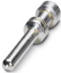
Turned 2.5 crimp contact, individual male contact, core diameter 2.5 mm 2 , silver-plated

Please be informed that the data shown in this PDF Document is generated from our Online Catalog. Please find the complete data in the user's documentation. Our General Terms of Use for Downloads are valid ( http://download.phoenixcontact.com )