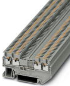
Feed-through terminal block, Connection method: Push-in connection, Cross section: 0.14 mm 2 - 1.5 mm 2 , AWG: 26 - 16, Width: 3.5 mm, Height: 30.5 mm, Color: gray, Mounting type: NS 35/7,5, NS 35/15

Please be informed that the data shown in this PDF Document is generated from our Online Catalog. Please find the complete data in the user's documentation. Our General Terms of Use for Downloads are valid ( http://download.phoenixcontact.com )