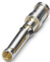
Turned 1.6 crimp contact, individual female contact, core diameter 0.5 mm 2 , silver-plated

Please be informed that the data shown in this PDF Document is generated from our Online Catalog. Please find the complete data in the user's documentation. Our General Terms of Use for Downloads are valid ( http://download.phoenixcontact.com )