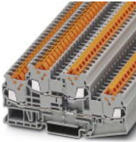
Component terminal block, Cross section: 0.25 mm 2 - 1.5 mm 2 , AWG: 24 - 16, Connection type: Quick connection, Width: 5.2 mm, Color: gray, Mounting type: NS 35/7,5, NS 35/15

Please be informed that the data shown in this PDF Document is generated from our Online Catalog. Please find the complete data in the user's documentation. Our General Terms of Use for Downloads are valid ( http://download.phoenixcontact.com )