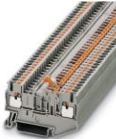
Knife disconnect terminal block, Connection type: Push-in connection, Cross section: 0.14 mm 2 - 4 mm 2 , AWG: 26 - 12, Nominal current: 20 A, Nominal voltage: 400 V, Length: 62 mm, Width: 5.2 mm, Color: gray, Assembly: NS 35/7,5, NS 35/15

Please be informed that the data shown in this PDF Document is generated from our Online Catalog. Please find the complete data in the user's documentation. Our General Terms of Use for Downloads are valid ( http://download.phoenixcontact.com )