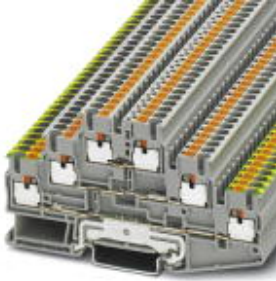
Multi-level terminal block, Connection method: Push-in connection, Cross section: 0.14 mm 2 - 4 mm 2 , AWG: 26 - 12, Width: 5.2 mm, Color: gray, Mounting type: NS 35/7,5, NS 35/15

Please be informed that the data shown in this PDF Document is generated from our Online Catalog. Please find the complete data in the user's documentation. Our General Terms of Use for Downloads are valid ( http://download.phoenixcontact.com )