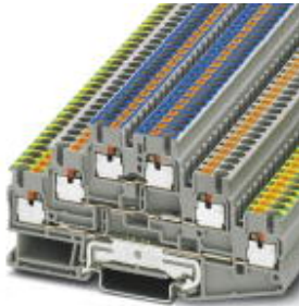
Multi-level terminal block, Connection method: Push-in connection, Cross section: 0.14 mm 2 - 4 mm 2 , AWG: 26 - 12, Width: 5.2 mm, Color: gray, Mounting type: NS 35/7,5, NS 35/15

Please be informed that the data shown in this PDF Document is generated from our Online Catalog. Please find the complete data in the user's documentation. Our General Terms of Use for Downloads are valid ( http://download.phoenixcontact.com )