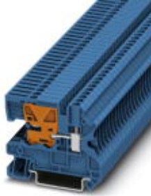
N disconnect terminal block, Screw connection, Cross section: 0.14 mm 2 - 4 mm 2 , AWG: 26 - 12, Width: 5.2 mm, Color: blue, Mounting type: NS 35/7,5, NS 35/15

Please be informed that the data shown in this PDF Document is generated from our Online Catalog. Please find the complete data in the user's documentation. Our General Terms of Use for Downloads are valid ( http://download.phoenixcontact.com )