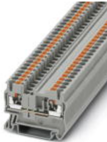
Feed-through terminal block, Connection method: Push-in connection, Cross section: 0.14 mm 2 - 4 mm 2 , AWG: 26 - 12, Width: 5.2 mm, Height: 35.3 mm, Color: gray, Mounting type: NS 35/7,5, NS 35/15

Please be informed that the data shown in this PDF Document is generated from our Online Catalog. Please find the complete data in the user's documentation. Our General Terms of Use for Downloads are valid ( http://download.phoenixcontact.com )