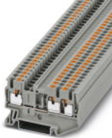
Feed-through terminal block, Connection method: Push-in connection, Cross section: 0.14 mm 2 - 4 mm 2 , AWG: 26 - 12, Width: 5.2 mm, Height: 35.2 mm, Color: gray, Mounting type: NS 35/7,5, NS 35/15

Please be informed that the data shown in this PDF Document is generated from our Online Catalog. Please find the complete data in the user's documentation. Our General Terms of Use for Downloads are valid ( http://download.phoenixcontact.com )