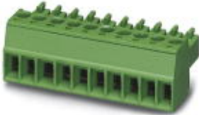
Plug component, Nominal current: 8 A, Rated voltage (III/2): 160 V, Number of positions: 3, Pitch: 3.81 mm, Connection method: Screw connection, Color: green, Contact surface: Tin

Please be informed that the data shown in this PDF Document is generated from our Online Catalog. Please find the complete data in the user's documentation. Our General Terms of Use for Downloads are valid ( http://download.phoenixcontact.com )