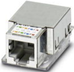
RJ45 socket insert, for the Freenet system, CAT5e, 8-pos., shielded, with cable connection (IDC fast connection), for solid wires AWG 24 ... 22

Please be informed that the data shown in this PDF Document is generated from our Online Catalog. Please find the complete data in the user's documentation. Our General Terms of Use for Downloads are valid ( http://download.phoenixcontact.com )